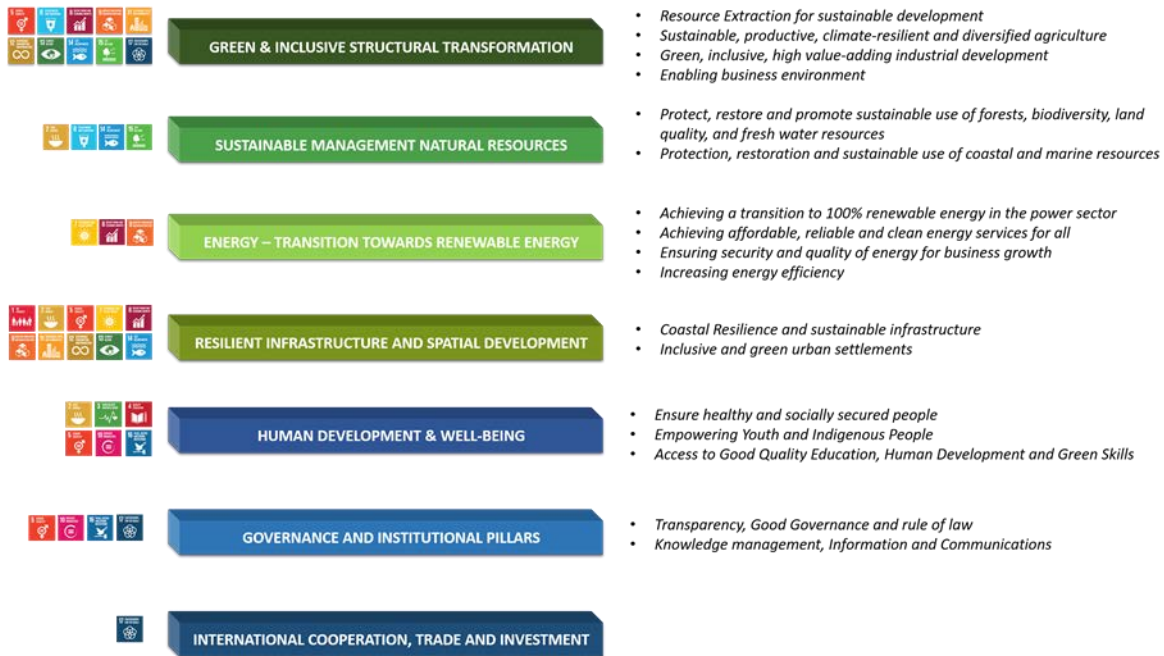
Figure 3. Central themes of the GSDS and its relation with the SDGs

Seven central themes will be comprehensively developed and implemented, responding to the country’s human and economic development, and addressing both the “Energy Transition Plan” and the implementation of the Sustainable Development Goals at the national level. See Figure 3.